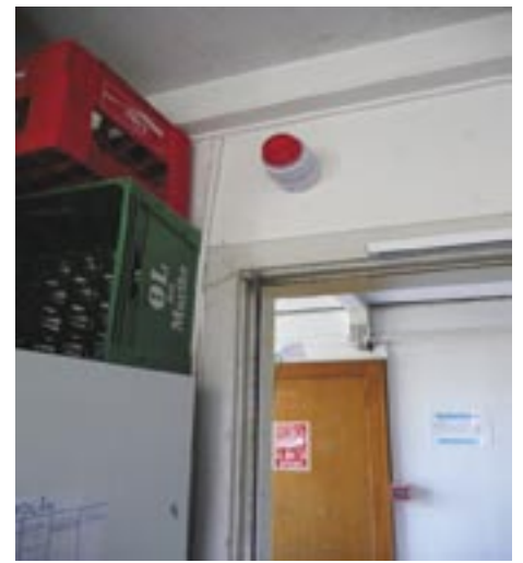
Speaker system kitchen