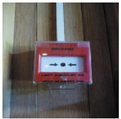
Fire alarm button