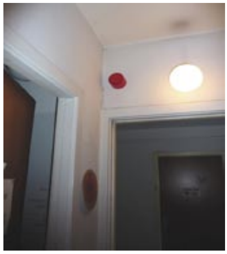
Speaker system hallways

There are fire alarm speaker systems installed in all hallways, kitchens and common rooms. If the fire alarm is activated the speakers will let out a loud, intense and constant sound. The sound exceeds 75 decibel, equal to the noise level of huge truck passing by your door. Still, you should always alert your neighbors, because some people have an incredible ability to sleep through extreme noise levels!