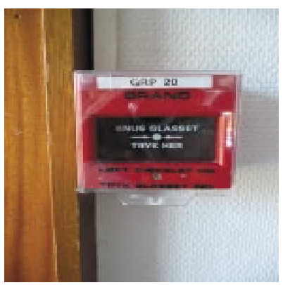
Fire alarm button

Fire can easily get out of control. Only try to fight a fire if it seems possible and safe. If the fire is spreading, you must activate the alarm as quickly as possible. This is done by pushing the nearest fire alarm button. Lift the cover and press the glass inwards. The alarm will then be activated in the entire dormitory and the fire unit is informed. As an alternative you can always call telephone number 112. When using a land line phone within Egmont, remember to call 0-1-1-2.